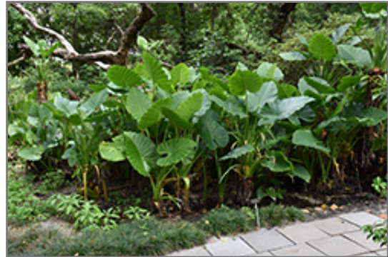
Calidora Elephant's Ear