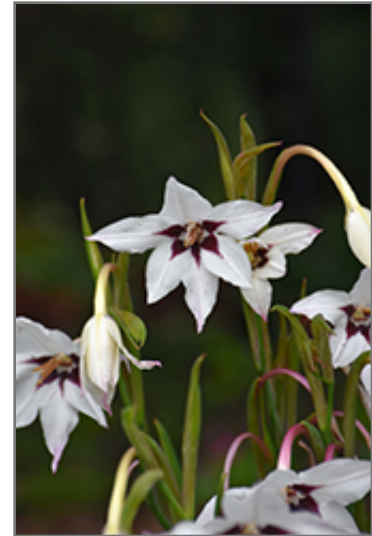
Abyssinian Gladiolus flowers

Abyssinian Gladiolus is recommended for the following landscape applications;