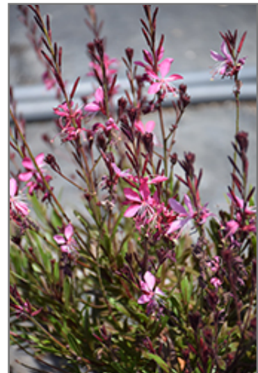
Whiskers Deep Rose Gaura flowers