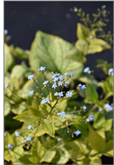
Jack's Gold Bugloss flowers

Jack's Gold Bugloss is recommended for the following landscape applications;