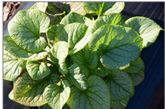
Jack's Gold Bugloss foliage