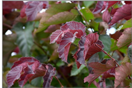
Purpleleaf Bailey Select American Hazelnut foliage