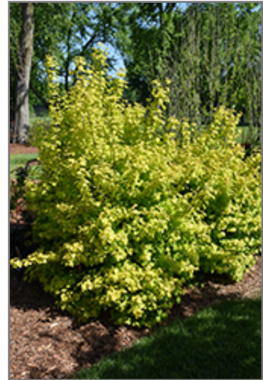
Oh Canada Cranberry Bush

This shrub does best in full sun to partial shade. It prefers to grow in average to moist conditions, and shouldn't be allowed to dry out. It is not particular as to soil type or pH. It is highly tolerant of urban pollution and will even thrive in inner city environments. This is a selected variety of a species not originally from North America.