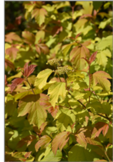
Oh Canada Cranberry Bush foliage