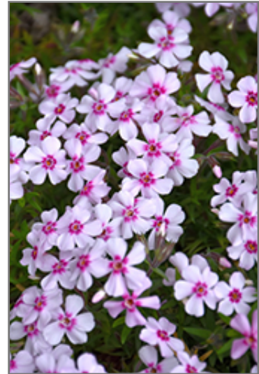
Coral Eye Moss Phlox flowers

Coral Eye Moss Phlox is a fine choice for the garden, but it is also a good selection for planting in outdoor pots and containers. Because of its spreading habit of growth, it is ideally suited for use as a 'spiller' in the 'spiller-thriller-filler' container combination; plant it near the edges where it can spill gracefully over the pot. Note that when growing plants in outdoor containers and baskets, they may require more frequent waterings than they would in the yard or garden.