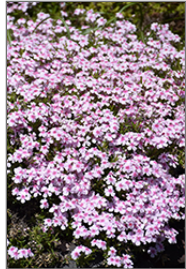
Coral Eye Moss Phlox flowers