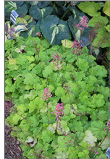
Primo Pretty Pistachio Coral Bells in bloom

This is a relatively low maintenance plant, and should be cut back in late fall in preparation for winter. It is a good choice for attracting butterflies and hummingbirds to your yard. It has no significant negative characteristics.