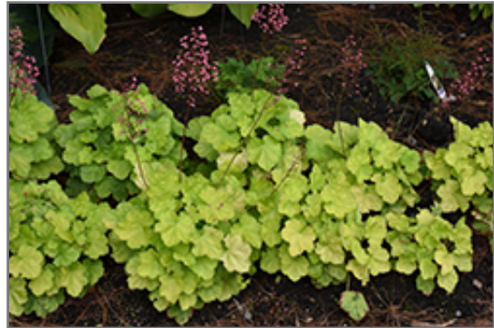
Primo Pretty Pistachio Coral Bells

Primo Pretty Pistachio Coral Bells is a fine choice for the garden, but it is also a good selection for planting in outdoor pots and containers. With its upright habit of growth, it is best suited for use as a 'thriller' in the 'spiller-thriller-filler' container combination; plant it near the center of the pot, surrounded by smaller plants and those that spill over the edges. Note that when growing plants in outdoor containers and baskets, they may require more frequent waterings than they would in the yard or garden.