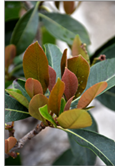
Coppertone Loquat foliage

Coppertone Loquat is a good choice for the edible garden, but it is also well-suited for use in outdoor pots and containers. Its large size and upright habit of growth lend it for use as a solitary accent, or in a composition surrounded by smaller plants around the base and those that spill over the edges. It is even sizeable enough that it can be grown alone in a suitable container. Note that when grown in a container, it may not perform exactly as indicated on the tag - this is to be expected. Also note that when growing plants in outdoor containers and baskets, they may require more frequent waterings than they would in a garden.