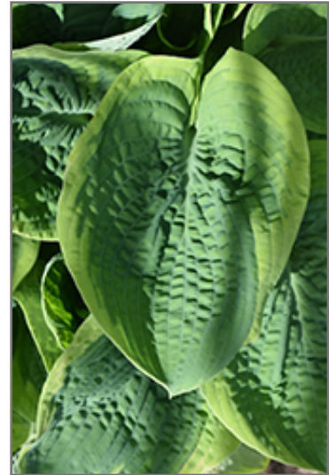
Frances Williams Hosta foliage

This plant does best in partial shade to shade. It prefers to grow in average to moist conditions, and shouldn't be allowed to dry out. It is not particular as to soil type or pH. It is somewhat tolerant of urban pollution. This particular variety is an interspecific hybrid. It can be propagated by division; however, as a cultivated variety, be aware that it may be subject to certain restrictions or prohibitions on propagation.