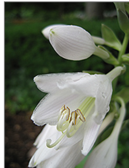
Frances Williams Hosta flowers