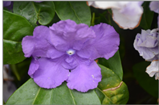
Yesterday Today And Tomorrow flowers

Yesterday Today And Tomorrow is recommended for the following landscape applications;