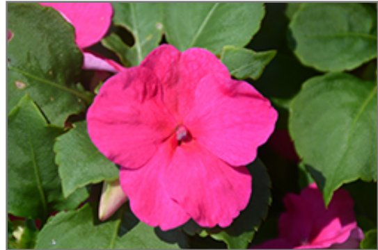
Accent Premium Rose Impatiens flowers

Accent Premium Rose Impatiens is recommended for the following landscape applications;