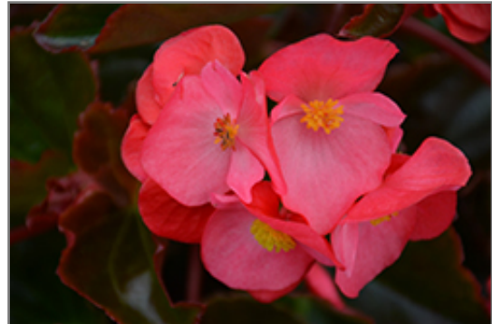
Megawatt Rose Bronze Leaf Begonia flowers

Megawatt Rose Bronze Leaf Begonia is an herbaceous annual with an upright spreading habit of growth. Its medium texture blends into the garden, but can always be balanced by a couple of finer or coarser plants for an effective composition.