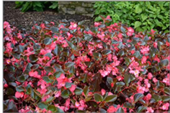
Megawatt Rose Bronze Leaf Begonia in bloom

Megawatt Rose Bronze Leaf Begonia is a fine choice for the garden, but it is also a good selection for planting in outdoor containers and hanging baskets. With its upright habit of growth, it is best suited for use as a 'thriller' in the 'spiller-thriller-filler' container combination; plant it near the center of the pot, surrounded by smaller plants and those that spill over the edges. It is even sizeable enough that it can be grown alone in a suitable container. Note that when growing plants in outdoor containers and baskets, they may require more frequent waterings than they would in the yard or garden.