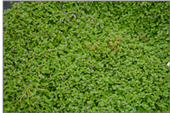
Mini Mint Ornamental Mint

Mini Mint Ornamental Mint is recommended for the following landscape applications;