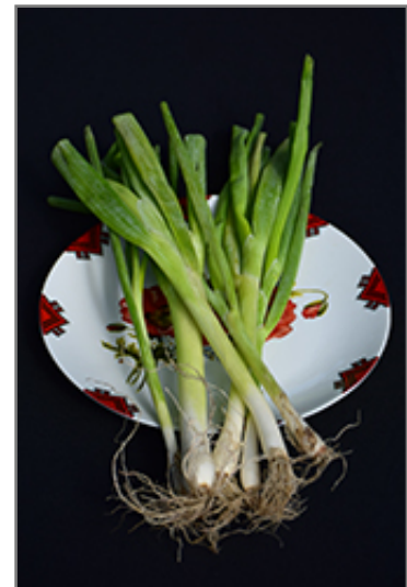
Spring Onion fruit