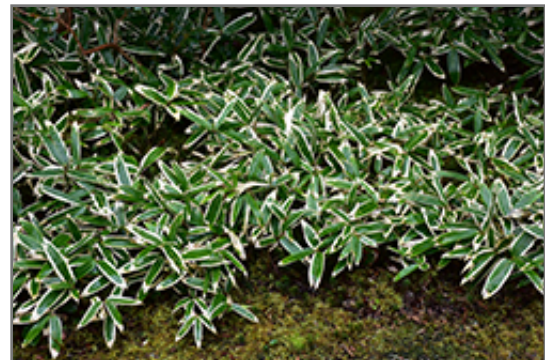
Veitch's Bamboo