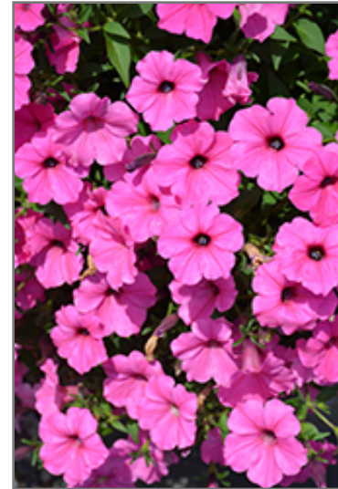
ColorRush Pink Petunia flowers

ColorRush Pink Petunia is recommended for the following landscape applications;