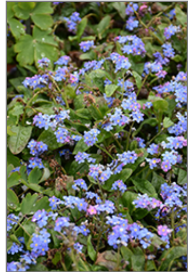
Victoria Blue Forget-Me-Not flowers

Victoria Blue Forget-Me-Not is recommended for the following landscape applications;