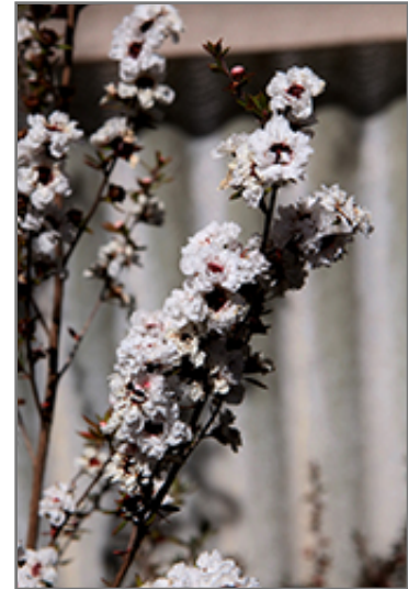
Snow White Tea-Tree flowers