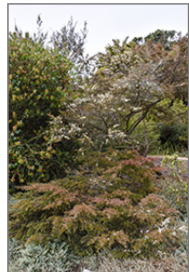
Broom Tea-Tree in bloom