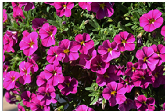
Cabaret Pink Star Calibrachoa flowers