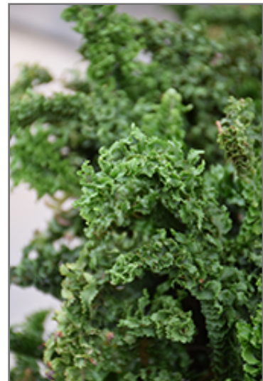
Emina Curly Boston Fern foliage