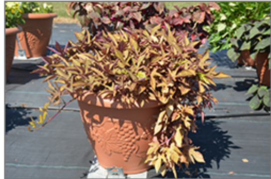
South of the Border Refried Beans Sweet Potato Vine

South of the Border Refried Beans Sweet Potato Vine is a fine choice for the garden, but it is also a good selection for planting in outdoor containers and hanging baskets. Because of its trailing habit of growth, it is ideally suited for use as a 'spiller' in the 'spiller-thriller-filler' container combination; plant it near the edges where it can spill gracefully over the pot. Note that when growing plants in outdoor containers and baskets, they may require more frequent waterings than they would in the yard or garden.