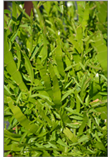
Ribbons and Curls Ribbon Bush foliage