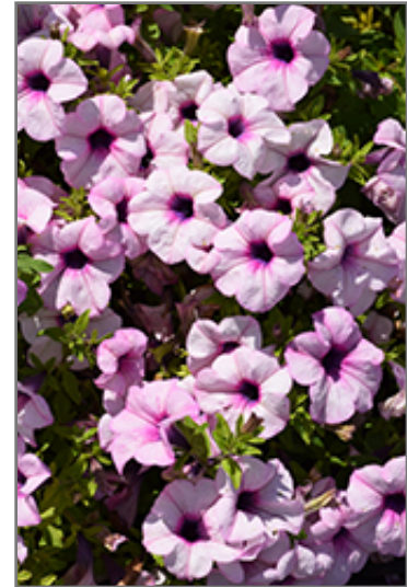
Surfinia Sumo Glacial Pink Petunia flowers

Surfinia Sumo Glacial Pink Petunia is a dense herbaceous annual with a trailing habit of growth, eventually spilling over the edges of hanging baskets and containers. Its medium texture blends into the garden, but can always be balanced by a couple of finer or coarser plants for an effective composition.