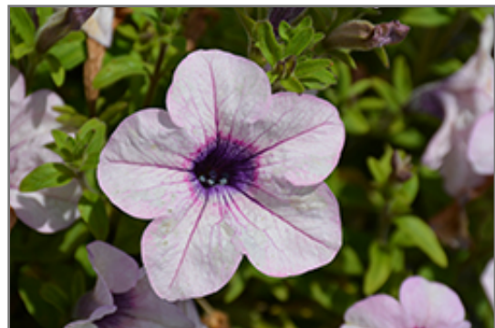
Surfinia Sumo Glacial Pink Petunia flowers