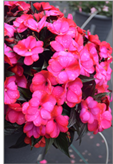
Infinity Blushing Lilac New Guinea Impatiens flowers

Infinity Blushing Lilac New Guinea Impatiens is recommended for the following landscape applications;