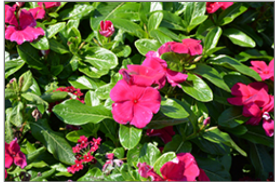
Cora Cascade Magenta Vinca flowers

Cora Cascade Magenta Vinca is recommended for the following landscape applications;