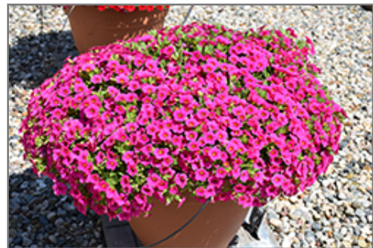
Million Bells Compact Brilliant Pink Calibrachoa in bloom