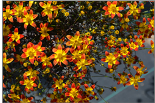
Beedance Painted Red Bidens flowers

Beedance Painted Red Bidens is recommended for the following landscape applications;