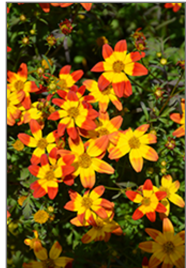
Beedance Painted Red Bidens flowers