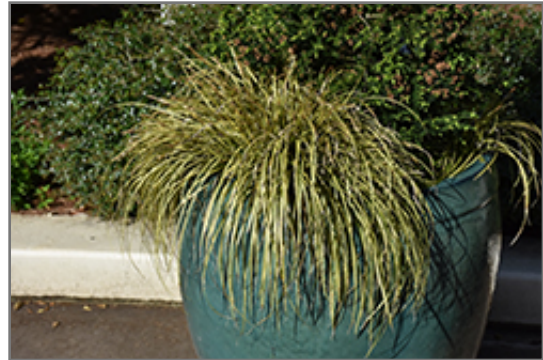
EverColor Eversheen Japanese Sedge

EverColor Eversheen Japanese Sedge is recommended for the following landscape applications;