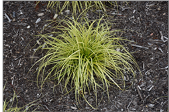
EverColor Eversheen Japanese Sedge

EverColor Eversheen Japanese Sedge will grow to be about 16 inches tall at maturity, with a spread of 16 inches. Its foliage tends to remain dense right to the ground, not requiring facer plants in front. It grows at a medium rate, and under ideal conditions can be expected to live for approximately 10 years. As an evergreen perennial, this plant will typically keep its form and foliage year-round.