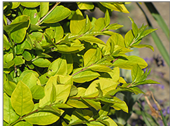
Golden Privet foliage