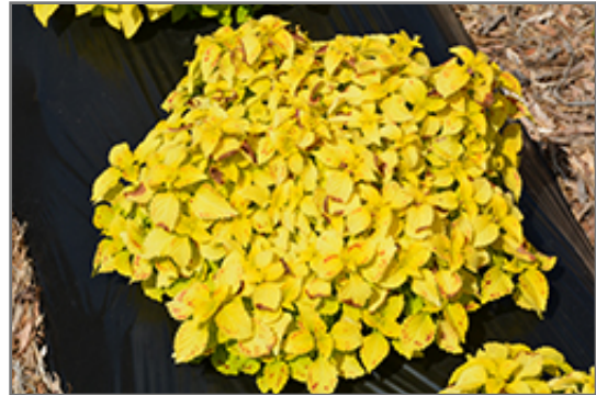
Terra Nova Pepperpot Coleus

Terra Nova Pepperpot Coleus is recommended for the following landscape applications;