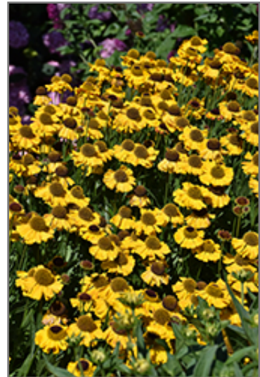
Wyndley Sneezeweed flowers