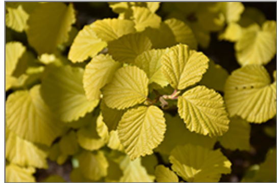
Akira's Sun Viburnum foliage

This is a relatively low maintenance shrub, and should only be pruned after flowering to avoid removing any of the current season's flowers. It is a good choice for attracting birds to your yard, but is not particularly attractive to deer who tend to leave it alone in favor of tastier treats. It has no significant negative characteristics.