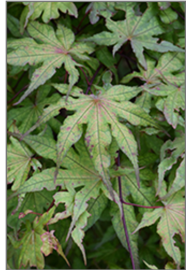
Amber Ghost Japanese Maple foliage