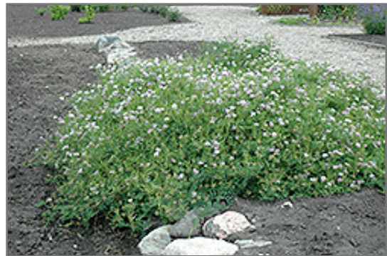
Crown Vetch in bloom