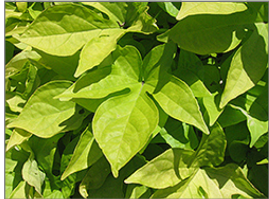
Sweet Caroline Light Green Sweet Potato Vine foliage

When grown indoors, Sweet Caroline Light Green Sweet Potato Vine can be expected to grow to be about 8 inches tall at maturity, with a spread of 5 feet. It grows at a fast rate, and under ideal conditions can be expected to live for approximately 1 years. This houseplant will do well in a location that gets either direct or indirect sunlight, although it will usually require a more brightly-lit environment than what artificial indoor lighting alone can provide. It does best in average to evenly moist soil, but will not tolerate standing water. The surface of the soil shouldn't be allowed to dry out completely, and so you should expect to water this plant once and possibly even twice each week. Be aware that your particular watering schedule may vary depending on its location in the room, the pot size, plant size and other conditions; if in doubt, ask one of our experts in the store for advice. It is not particular as to soil type or pH; an average potting soil should work just fine.