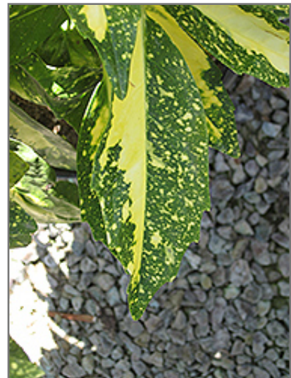
Variegated Japanese Aucuba foliage