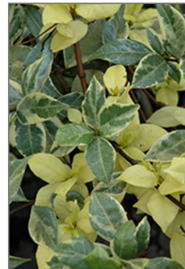
Variegated Confederate Star-Jasmine foliage