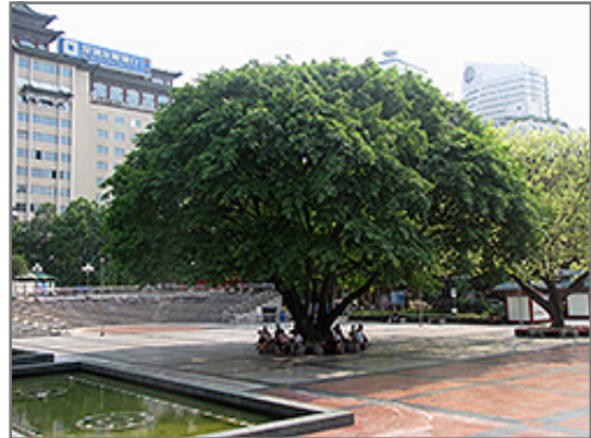
Indian Laurel Fig

This is a multi-stemmed evergreen houseplant with a more or less rounded form. This plant may benefit from an occasional pruning to look its best.