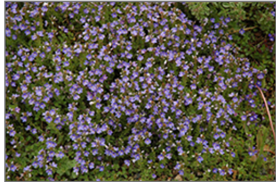
Turkish Speedwell in bloom

Turkish Speedwell is recommended for the following landscape applications;