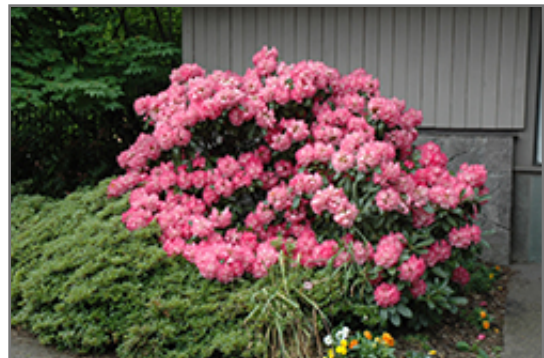
Morgenrot Rhododendron in bloom