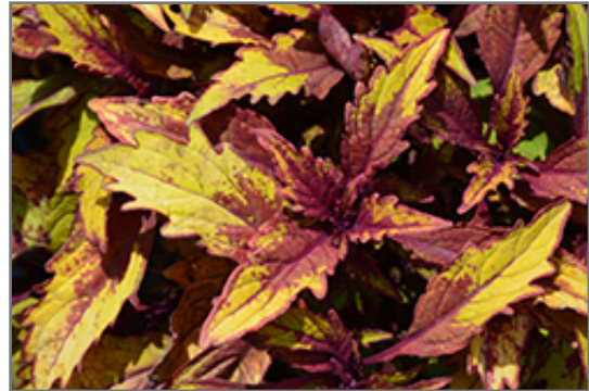
FlameThrower Spiced Curry Coleus foliage

FlameThrower Spiced Curry Coleus is recommended for the following landscape applications;