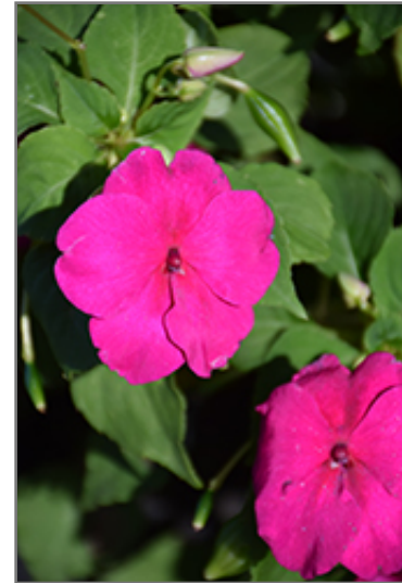
Lollipop Raspberry Violet Impatiens flowers

Lollipop Raspberry Violet Impatiens is recommended for the following landscape applications;