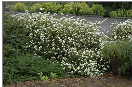
White Rockrose in bloom