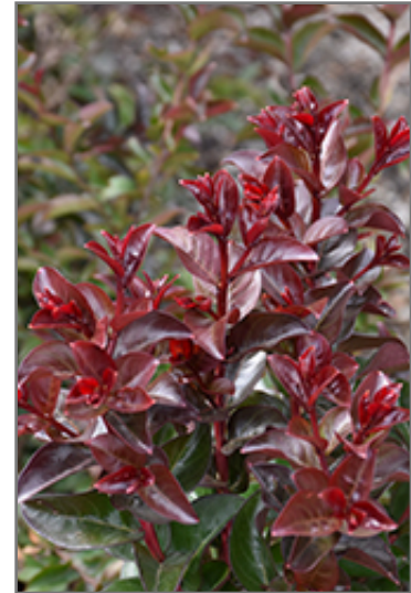
Cherry Mocha Crapemyrtle foliage

Cherry Mocha Crapemyrtle makes a fine choice for the outdoor landscape, but it is also well-suited for use in outdoor pots and containers. With its upright habit of growth, it is best suited for use as a 'thriller' in the 'spiller-thriller-filler' container combination; plant it near the center of the pot, surrounded by smaller plants and those that spill over the edges. It is even sizeable enough that it can be grown alone in a suitable container. Note that when grown in a container, it may not perform exactly as indicated on the tag - this is to be expected. Also note that when growing plants in outdoor containers and baskets, they may require more frequent waterings than they would in the yard or garden.