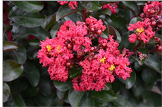
Cherry Mocha Crapemyrtle flowers

Cherry Mocha Crapemyrtle is recommended for the following landscape applications;