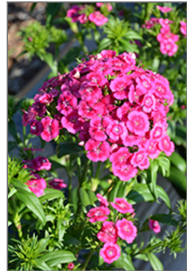
Jolt Pink Hybrid Pinks flowers