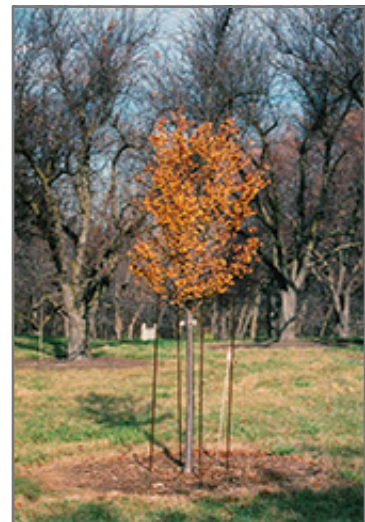
Lancelot Flowering Crab fruit