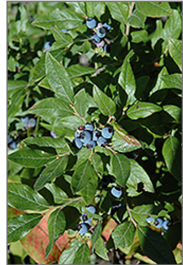
Lowbush Blueberry fruit

Lowbush Blueberry features dainty clusters of white bell-shaped flowers with shell pink overtones hanging below the branches in mid spring. It has dark green deciduous foliage. The oval leaves turn an outstanding scarlet in the fall. It features an abundance of magnificent blue berries in mid summer.