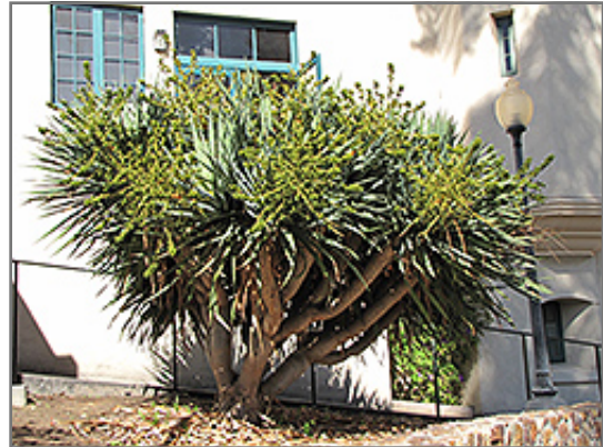
Dragon Tree (shrub form)

Dragon Tree (shrub form) is recommended for the following landscape applications;